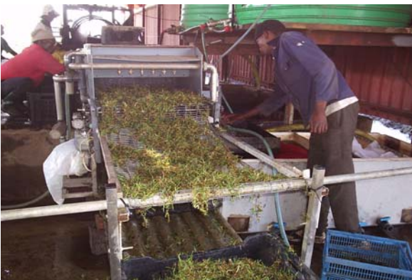
Washing and sterilizing the grass

The grass is grown indoors and prior to dispatch shredded, washed, treated with fungicides, cooled and then packed into plastic boxes.