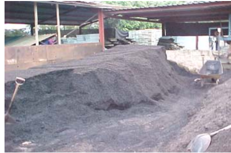
Trays filled with 100% soilless media