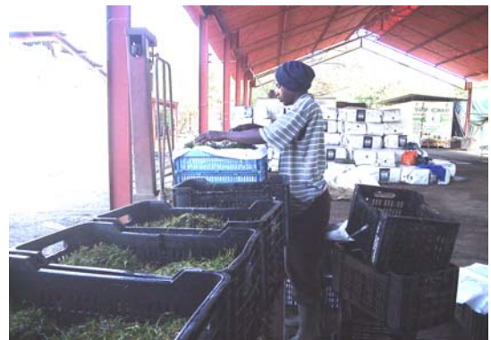
Weighing the grass before packing into boxes