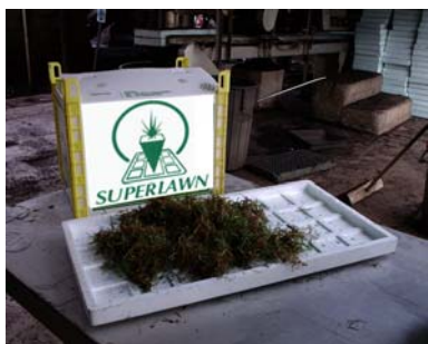
Illustration of box and the shredded cleaned material

The grass will last for a minimum of eight weeks if refrigerated and test have shown up to three months (12 weeks) if stored for at between 5-7 degrees centigrade. After receiving the grass keep refrigerated or in a cool place until planting begins. Do not allow to get warm or dry out!