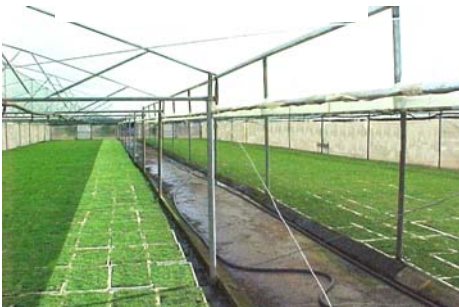
Grass grown indoors no contamination and no weeds.